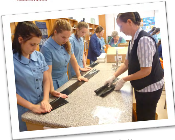
Coming to grips with folding the plastic