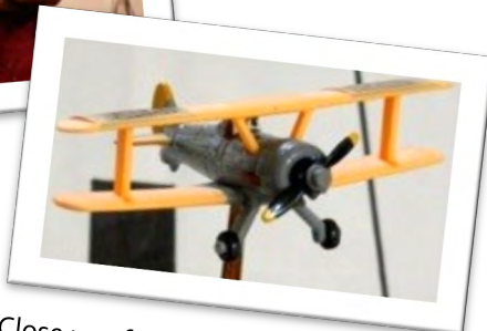
Close up of the trophy